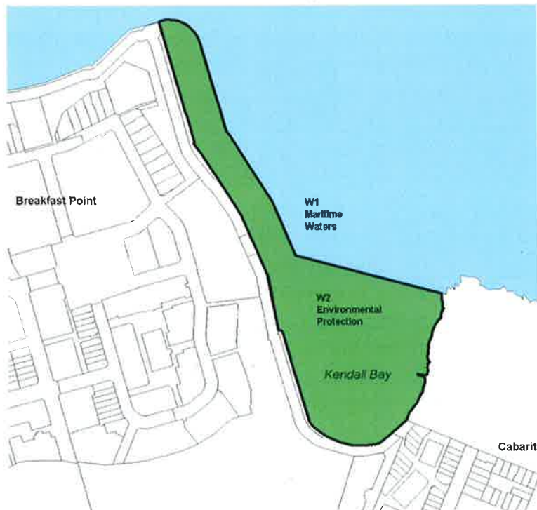
Figure 2: Block plan of subject location, showing the intended zone W2 Environmental Protection zone.