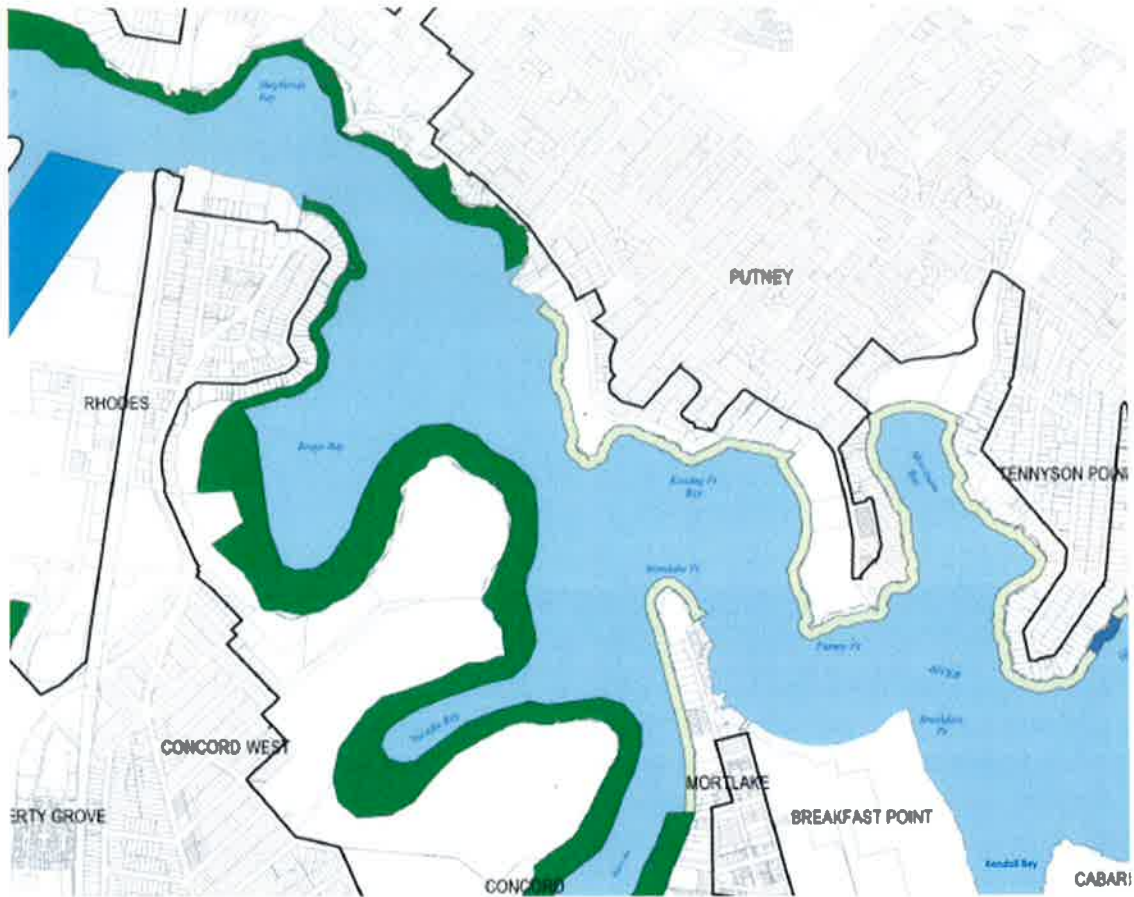
Figure 3: The portion of Map 2 of the SREP (Sydney Harbour Catchment) 2005 shown above illustrates how the W2 zone has been applied to areas adjacent to Kendall Bay in the Canada Bay locality. The proposed zoning reflects a similar form and scale of the W2 Environmental Protection zone shown above and for the protection of the natural and cultural values of Kendall Bay.