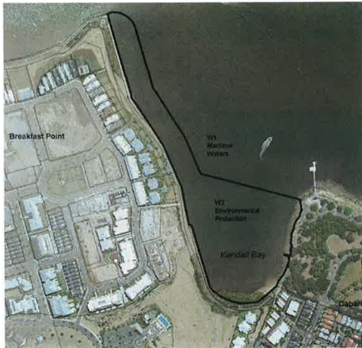
Figure 1: Aerial photograph of the subject location